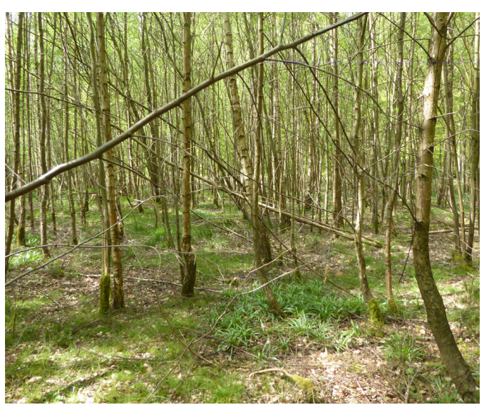
Figure 4: Only the 80 per cent thin treatment significantly increased natural regeneration and stand scale diversity (remaining trees were removed 2010/11).

*An RFS visit to Escot Estate, near Honiton, Devon on October 2nd will look at planned long-term experiments with oak CCF, of which there are very few examples in the UK.