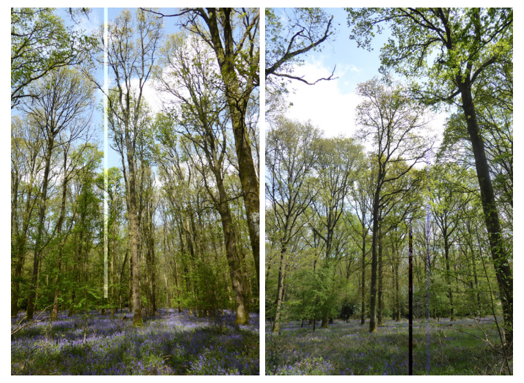
Figure 1: Growth and yield of oak under different thinning regimes. Left: No thin plot. Right: Heavy thin plot.

The experimental site represents one of the network of permanent mensuration sample plots established and maintained by Forest Research.