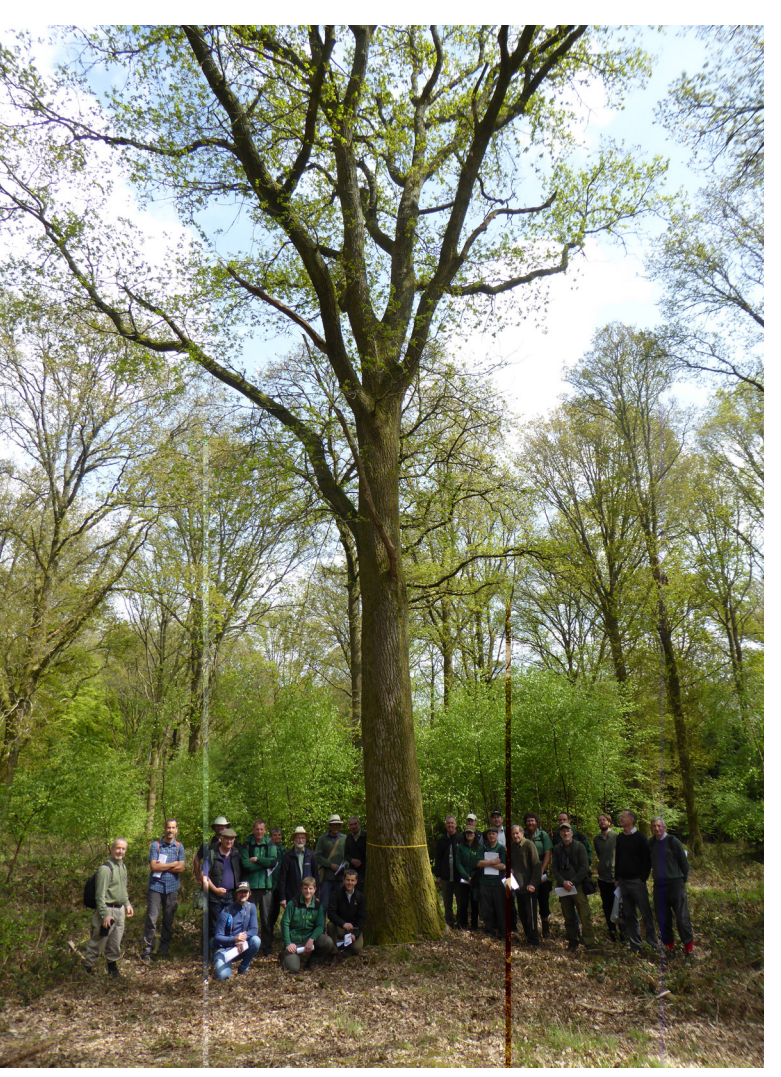
Figure 3: Possibly the largest diameter oak for its age in Britain.

As highlighted by members of the group, the financial returns possible for high quality oak are currently excellent, with the construction market buoyant. As an example, the 'free grown' oak pictured in Figure 2 (64cm dbh) was thought likely to achieve around £180/m<sup>3</sup> for the first 5m of the stem at rideside, with stems of 85-90cm dbh optimal. A final key point was brought to light at this stop - unlike species such as sycamore and beech, oak is susceptible to entering a state in which the growth rate does